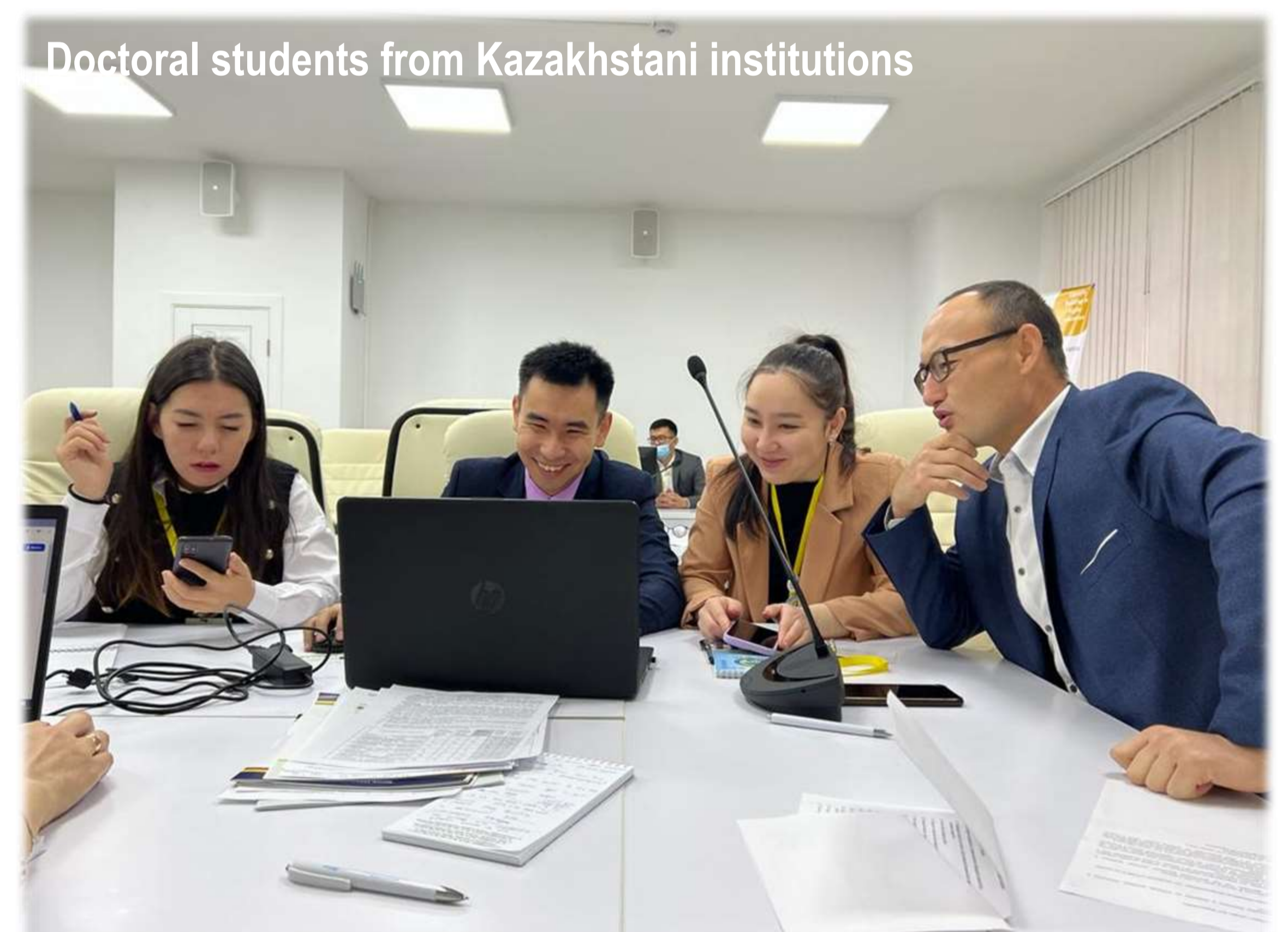
Doctoral students from Kazakhstani institutions

There was a round table with doctoral students who participated in the events and activities of SAGRIS project. They had opportunity to share their experience and impressions from what they have studied and explored and, of course, to communicate with “older” scientists and teachers, establish professional contacts and integrate into scientific community.