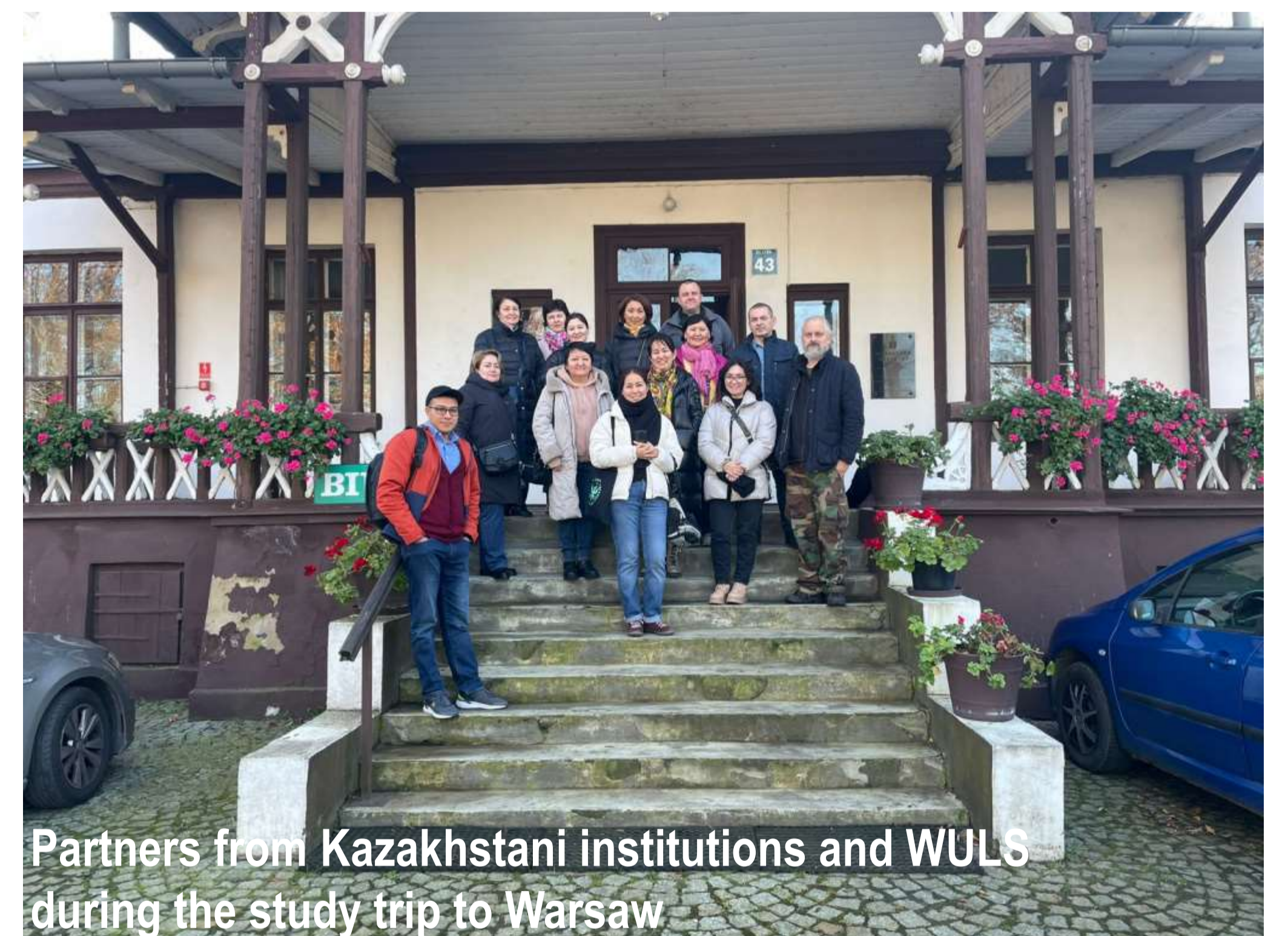
Partners from Kazakhstani institutions and WULS during the study trip to Warsaw