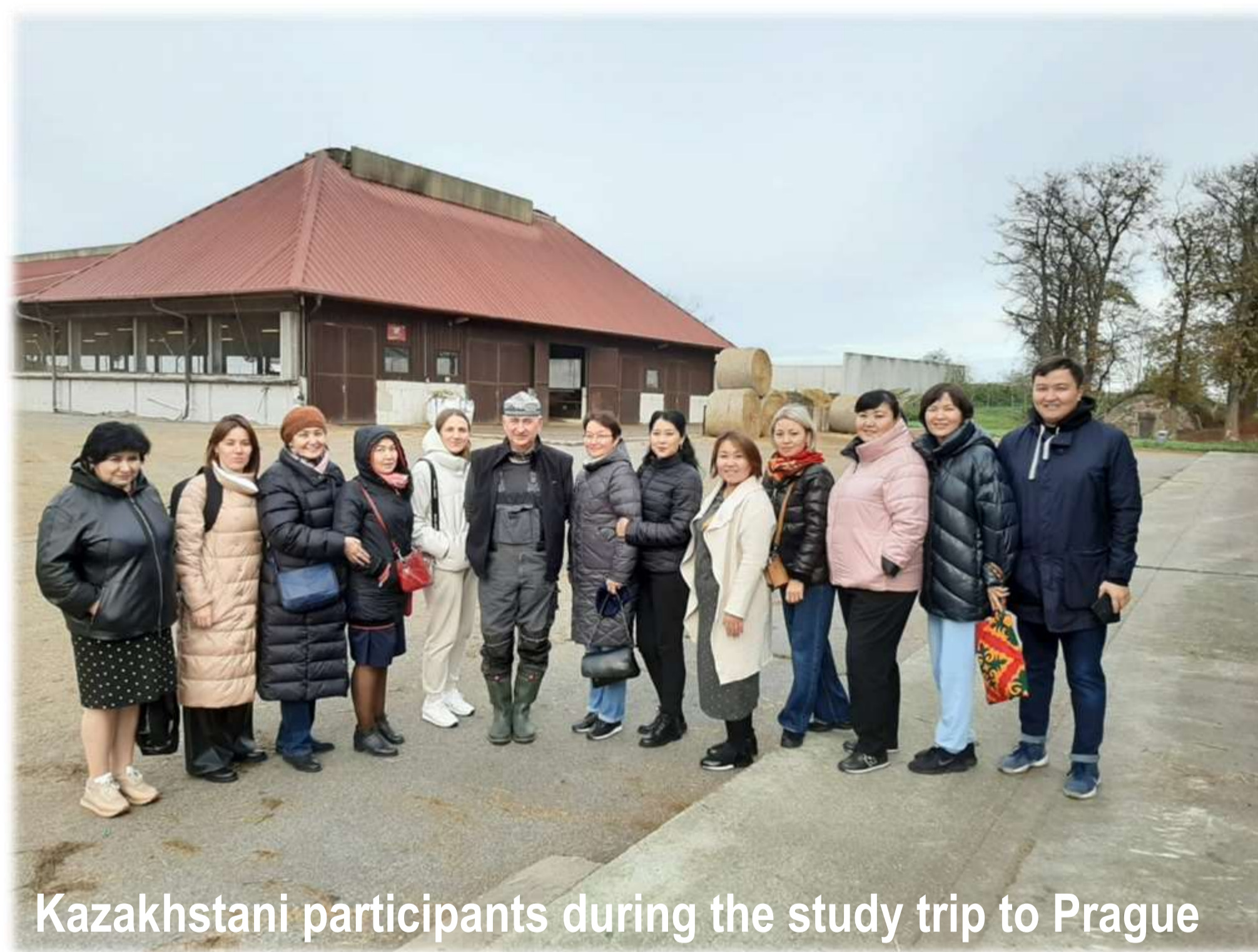
Kazakhstani participants during the study trip to Prague