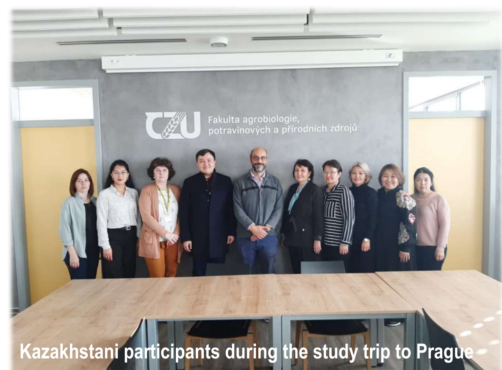
Kazakhstani participants during the study trip to Prague

Video and photos of the Block Seminar here: