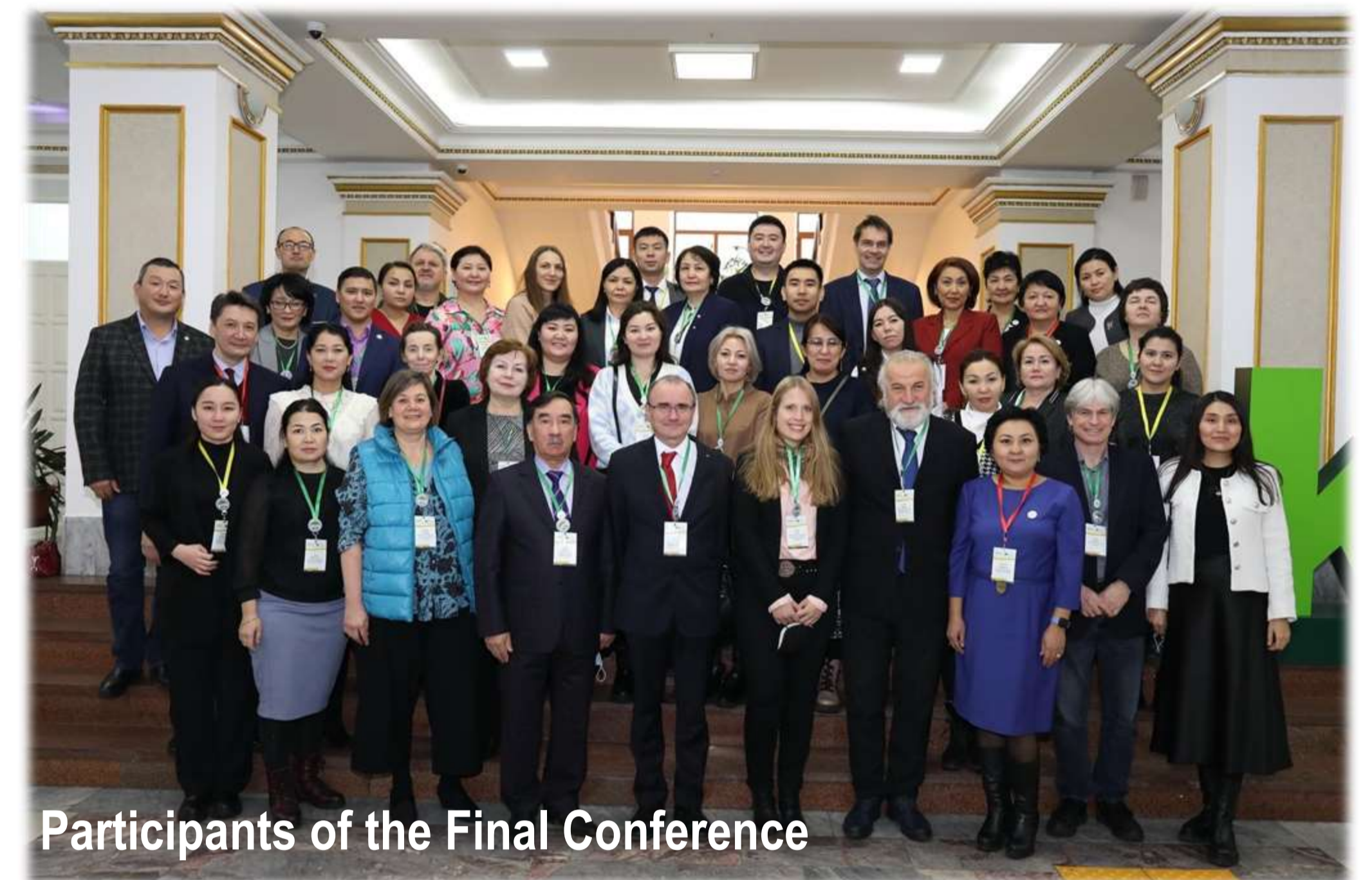
Participants of the Final Conference